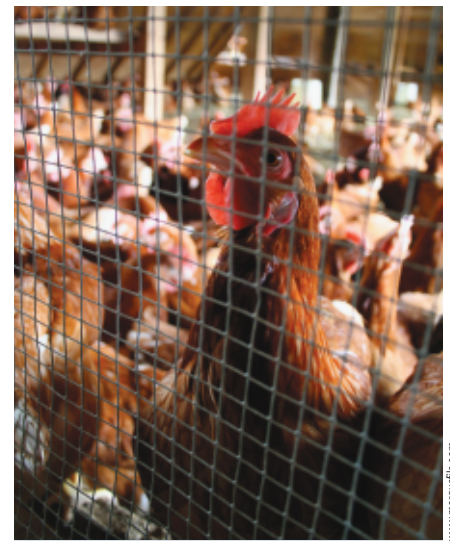
Avian influenza H5N1 is perceived as the emerging infectious disease posing the greatest global impact.

The influenza A H5N1 virus, most commonly found in birds, has the potential to cross the species barrier and infect humans, as has occurred in south-east Asia. The recent outbreak of infection in turkeys in England has again raised concern about this particular serotype as the source of the next human influenza pandemic. Here, Richard A Collins provides an update.